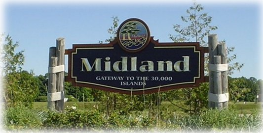
Town of Midland