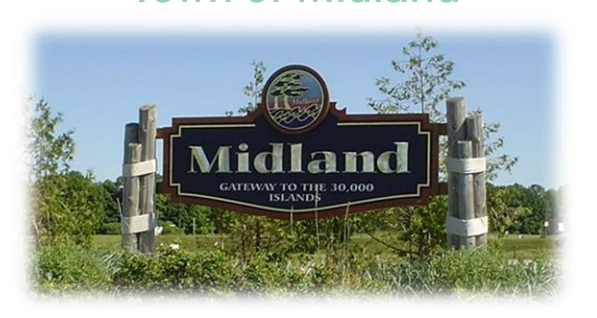
Town of Midland